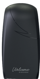
909 Dispenser for interfolded toilet paper