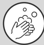
Dispenser for soap