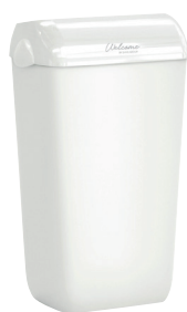
740 Waste paper bin

mm 545 H x 225 D x 335 W Kg 1,73 Matt black