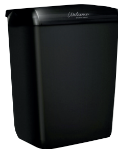
741 Waste paper bin

mm 545 H x 225 D x 335 W Kg 1,73 Matt white