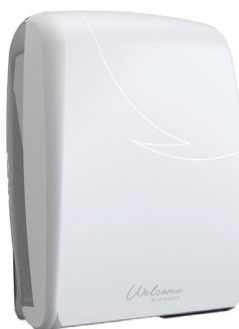
903 Dispenser for C, V or Z-folded paper