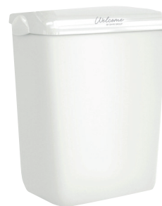
741 Waste paper bin

mm 570 H x 280 D x 420 W Kg 2,4 Matt black