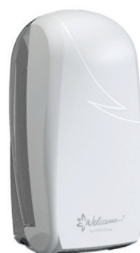
909 Dispenser for interfolded toilet paper