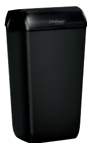
740 Waste paper bin

mm 545 H x 225 D x 335 W Kg 1,73 Matt black