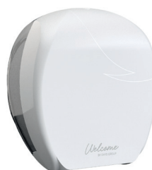
907 Mini-Jumbo toilet paper dispenser