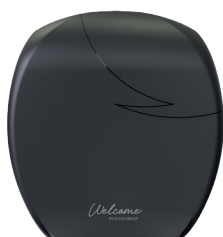
907 Mini-Jumbo toilet paper dispenser