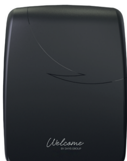
903 Dispenser for C, V or Z-folded paper