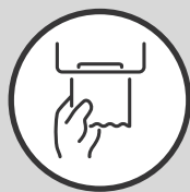
Dispenser for paper

Welcome to a clean and practical experience.